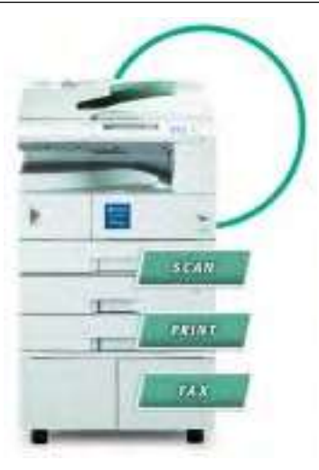
2016spf: For efficient document management in a space-saving design.