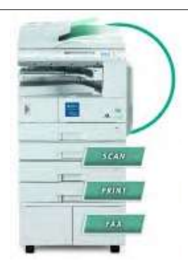
2020Dspf: For total document management, including a One-Bin Tray and Duplexing capability.