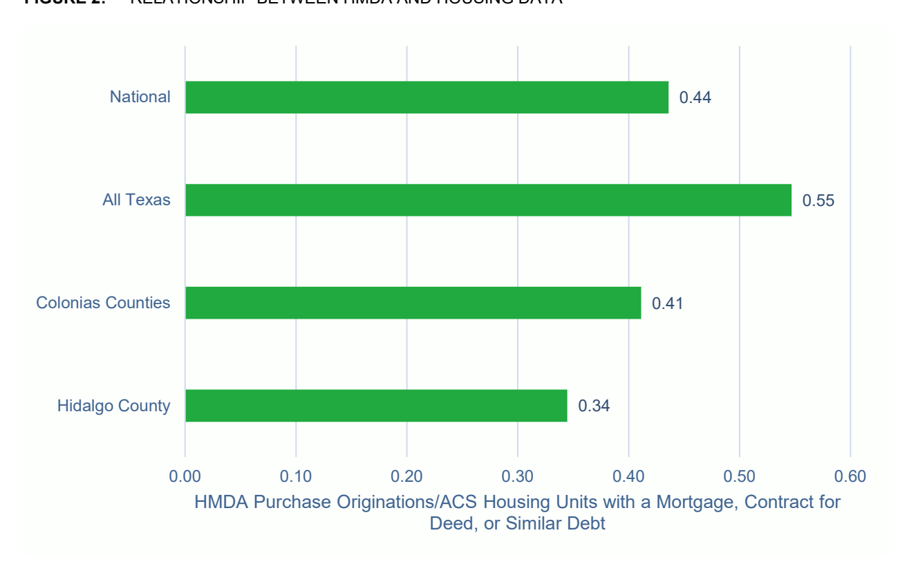
FIGURE 2: RELATIONSHIP BETWEEN HMDA AND HOUSING DATA

home purchase mortgage lending activity per housing unit with a mortgage when compared to all of Texas and nationally.<sup>77</sup> These counties contain large Hispanic populations.<sup>78</sup>